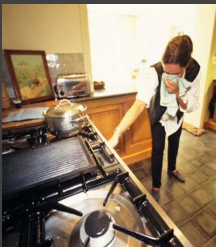
THINK YOU SMELL GAS ACT FAST!